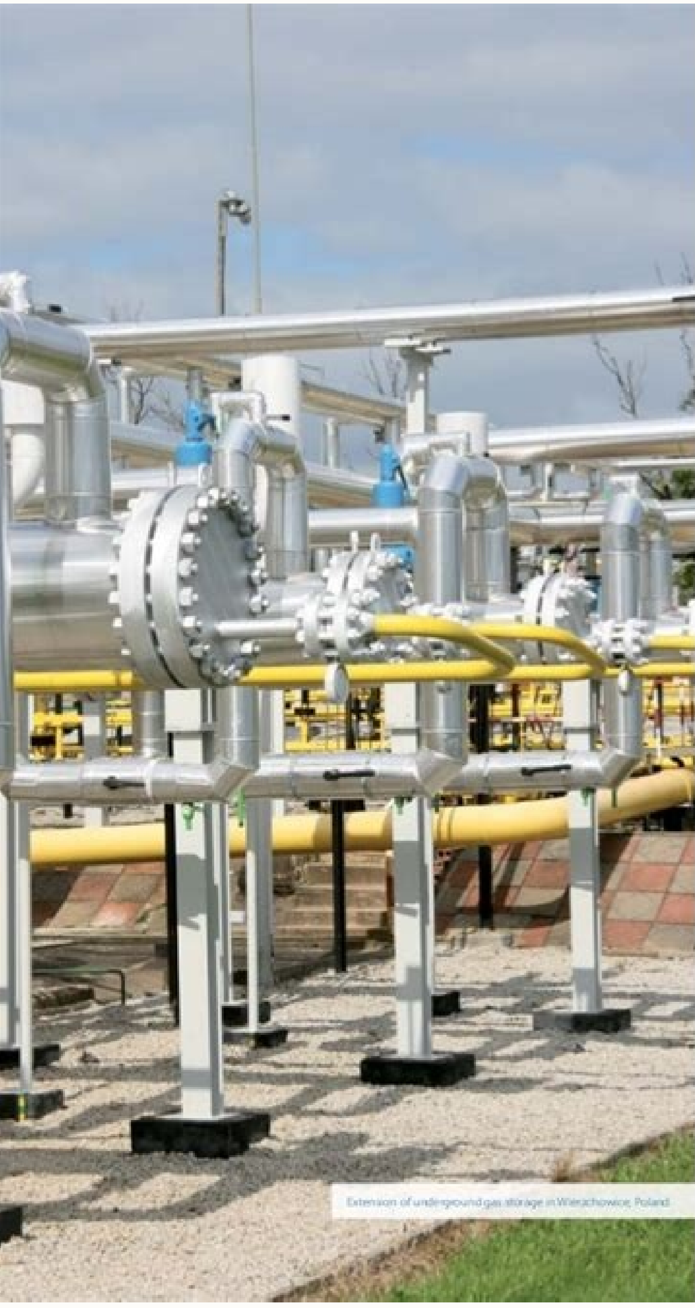
Extension of underground gas storage in Wierzbichowice, Poland